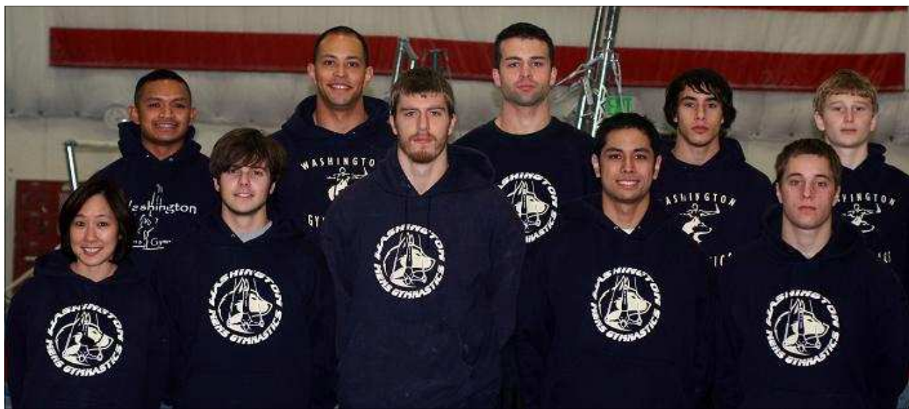
Your 2009-2010 Husky Gymnastics Team

Our schedule this year is very similar to last year's. Please check the dates and if you're in the neighborhood, stop by and see us! Don't be shy – introduce yourself and come out to dinner with us after the meet. It's a great time... really!